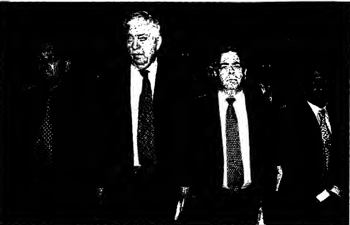
Labor Party MKs (from left) Ehud Barak, Uzi Baram, Ephraim Sneh, and Shlomo Ben-Ami stand at attention during the playing of the national anthem at yesterday's convention closing in Tel Aviv.

Yesterday evening, gunmen opened fire with mortars at South Lebanese Army outposts in the zone's eastern and western sectors. There were no casualties and IDF gunmen returned fire.